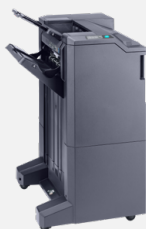
DF-791 3,000-sheet Finisher Staples up to 65-sheets