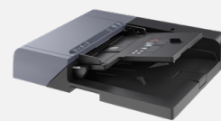
DP-7140 Reversing Auto Document Processor 50-sheet capacity 50 ipm simplex / 16 ipm duplex