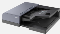
DF-7150 Reversing Auto Document Processor 140-sheet capacity 80 ipm simplex / 48 ipm duplex