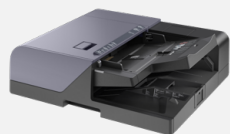
DP-7170 Dual Scan Document Processor 320-sheet capacity w/ multi-feed & staple detect 100 ipm simplex / 200 ipm duplex