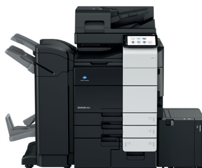
bizhub i-Series 950i