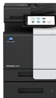
bizhub i-Series C4051i