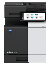
bizhub i-Series C3351i