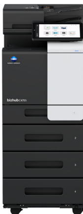
bizhub i-Series C4751i