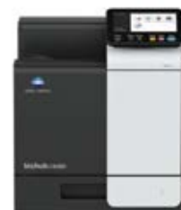
bizhub i-Series C4000i