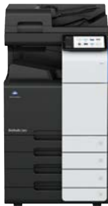
bizhub i-Series C360i

So as your business grows, we will grow with you – seamlessly linking people and places to give a new dimension to document workflow and security management.