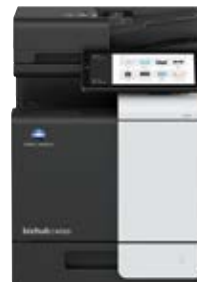
bizhub i-Series C4050i