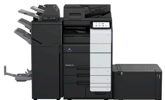
bizhub i-Series 750i