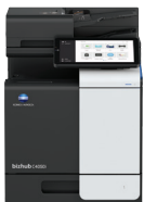
bizhub i-Series C4050i