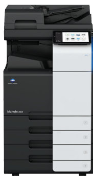
bizhub i-Series C360i