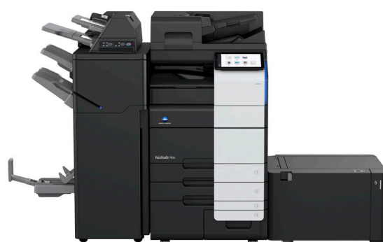
bizhub i-Series 750i