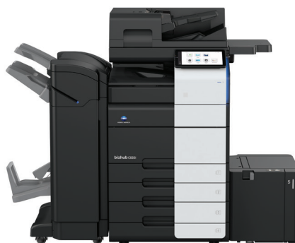
bizhub i-Series C650i