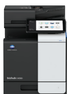
bizhub i-Series C4050i

To learn more, please visit workplacehub.konicaminolta.com