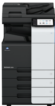
bizhub i-Series C360i