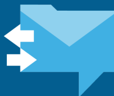
FILE BACKUP & COLLABORATION